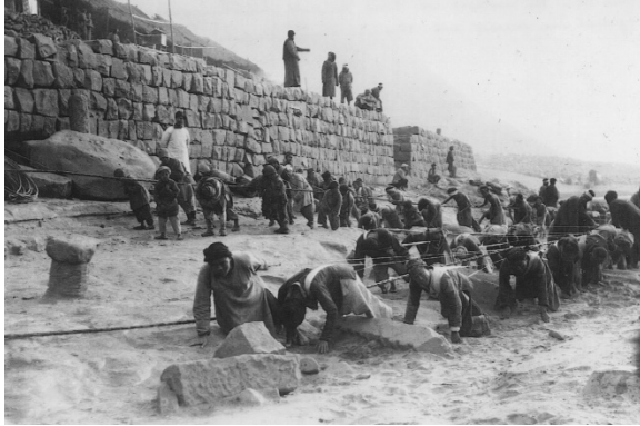
Yangtze River Trackers