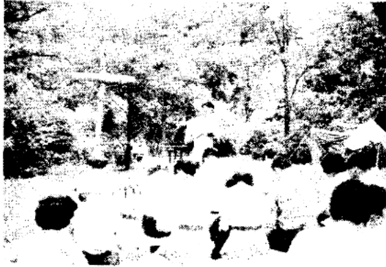
露營中的主日崇拜 Camp's Sunday Prayer

In the Summer, we have a picnic in the green woods