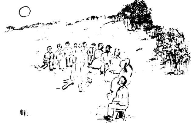
中秋節的寫真——七十六歲的山老先生繪 Observational drawing of a Mid-Autumn Festival celebration drawn by a 76 year old man