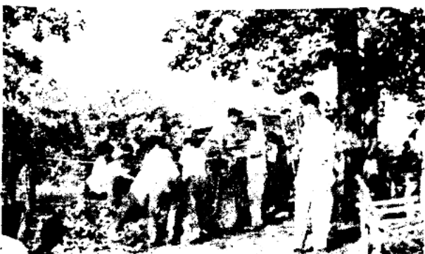
Chinese families outdoor picnic