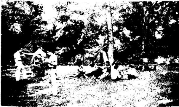
Midwest CSAS weekend camping