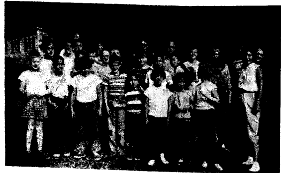
GLEN EYRLE CAMPERS AUGUST 1958